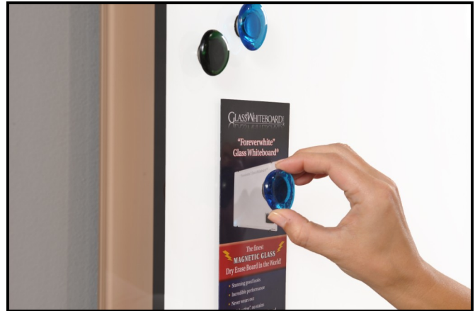
Fully Magnetic Custom Glass Memo Magnets included

The reason most whiteboards are actually white is because standard dry erase pens contrast best against the white background. This is especially true with color pens such as red, green, or blue. Clear or frosted glass marker boards can also be poor backgrounds for contrast.