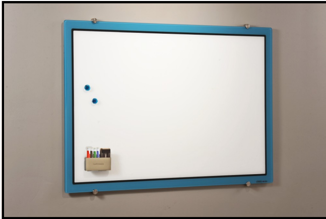
Magnetic Organizer Set with Pens and Eraser included