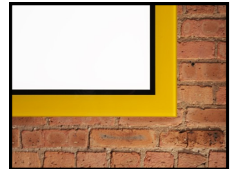
Customizable border color

Introducing the new “Designer” Series magnetic glass dry erase board by GlassWhiteboard.com. Offering design options to architects, interior designers and sophisticated buyers, the brilliant white magnetic glass whiteboard surface is set off by the contrasting border color which can be matched to any Pantone® or Benjamin Moore® color code.